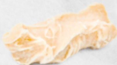
Canillitas de leche

Box of 15: 40. 00 Bag 12. 00 Canillitas de Leche Morenas 16. 00