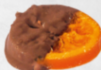
Chocolate covered candied orange 11. 00