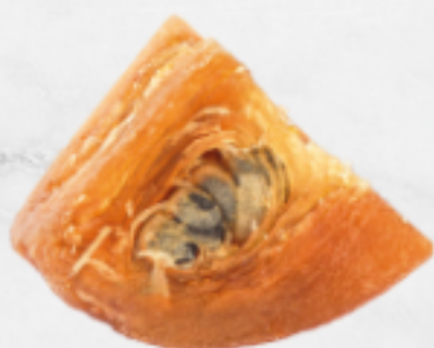
Chilacayote 30. 00

Figs With cocada real 14. 00 With mazapán 12. 00 Plain 7. 00