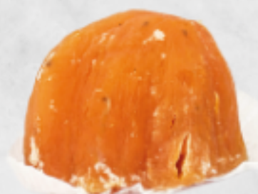
Camote 22. 00 Candied Sweet Potato