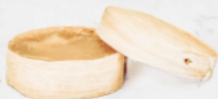
Mazapán de Cajeta 22. 00