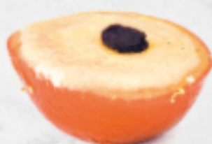
Naranja rellena de Mazapán 28. 00 Marzipan filled Candied Orange