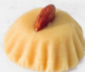
Almendrita de leche 13. 00