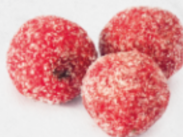
Tamarindos 5. 00