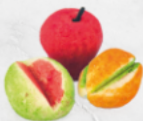
Frutitas de Mazapán 10. 00