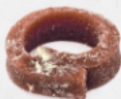
Colochos de Guayaba 6. 00